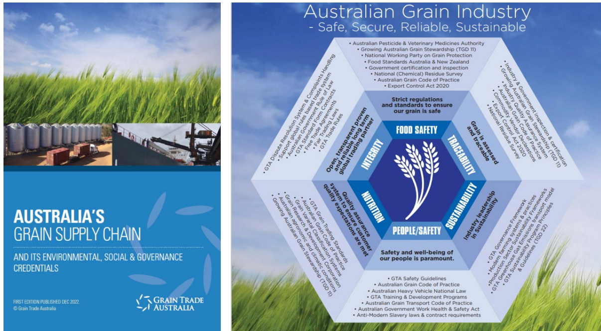
Figure 1 – Australian Grain Industry ESG Credentials

In addition, and recognising the sustainability objectives of individual companies in the grain supply chain whilst varied, support an efficient, health focussed and safe global grain trade that improves the world’s food security. GTA has published under the Australian Grain Industry Code of Practice Technical Guideline Document (TGD) 22. Sustainability Program Principles & Guidelines . The purpose of this document is to assist individual businesses as they consider their sustainability objectives and programs.